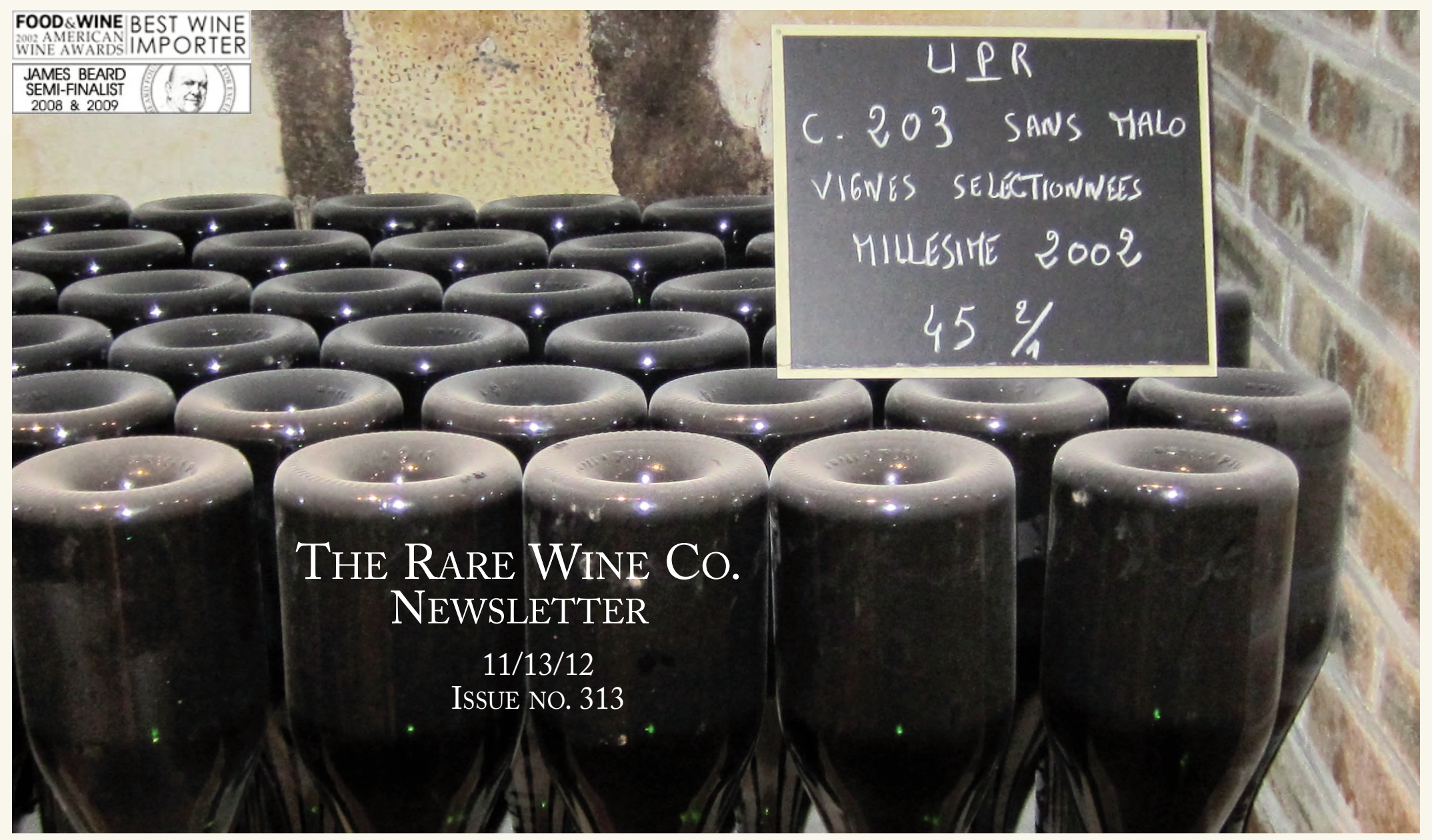
Magnums of Le Mesnil's special 2002 "Sans Malolacqitue" sur pointe. See page 5.